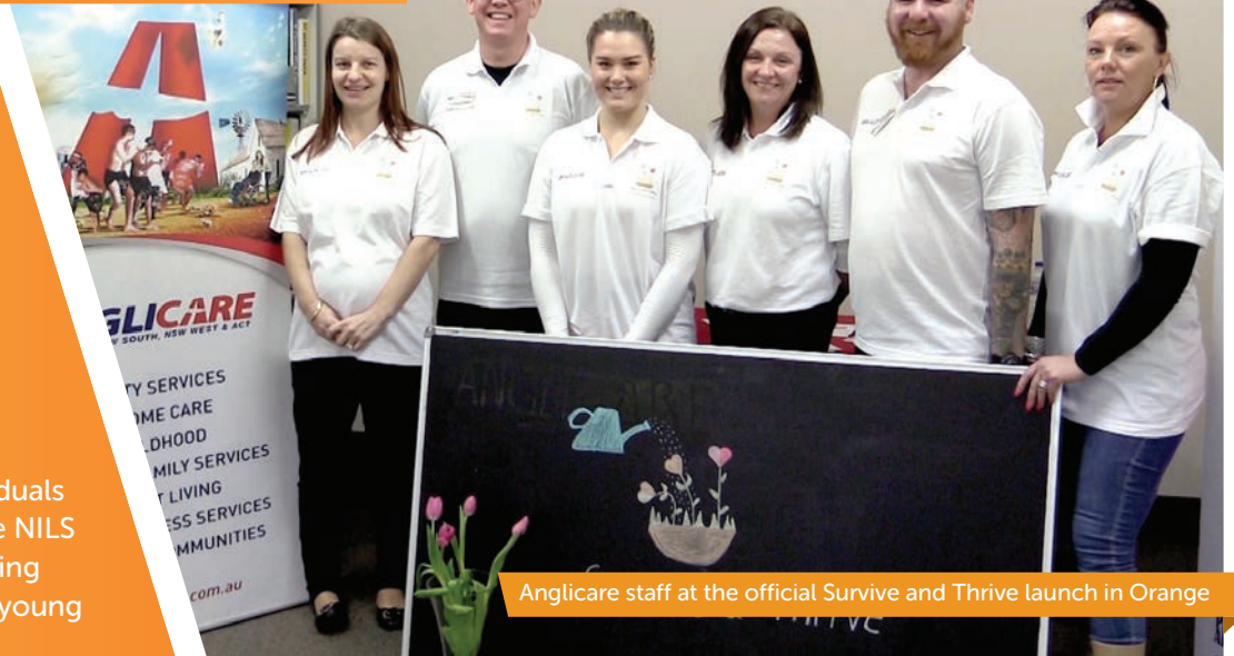
Anglicare staff at the official Survive and Thrive launch in Orange