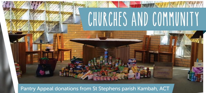
Pantry Appeal donations from St Stephens parish Kambah, ACT