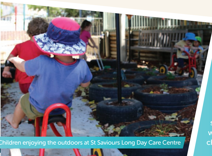
Children enjoying the outdoors at St Saviours Long Day Care Centre