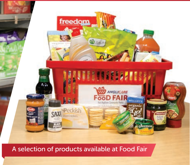
A selection of products available at Food Fair