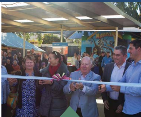
Opening of the new Gordon Community Centre

people received emergency relief assistance across Anglicare's sites in 2016/17 (this is the DEX session client attendance figure plus the number of pantry only clients assisted at St John's Care)