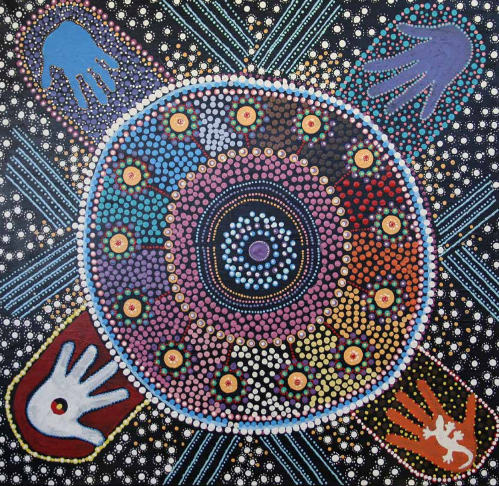
OVER THE RAINBOW (October 2017) - Created by young women in Anglicare's residential Rainbow House in Wagga