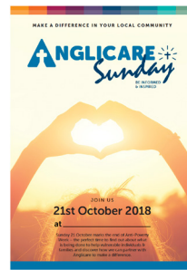
Anglicare Sunday posters

Liturgical resources including suggested hymns, prayers and readings have also been made available on the Anglicare Sunday website.