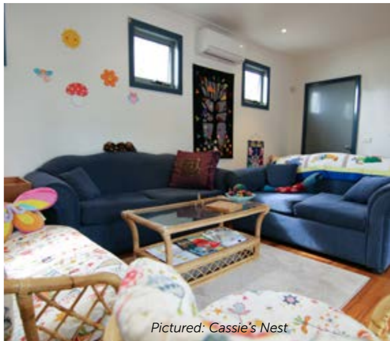
Pictured: Cassie's Nest