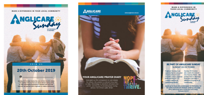
Anglicare Sunday posters

Liturgical resources including suggested hymns, prayers and readings have also been made available on the Anglicare Sunday website.