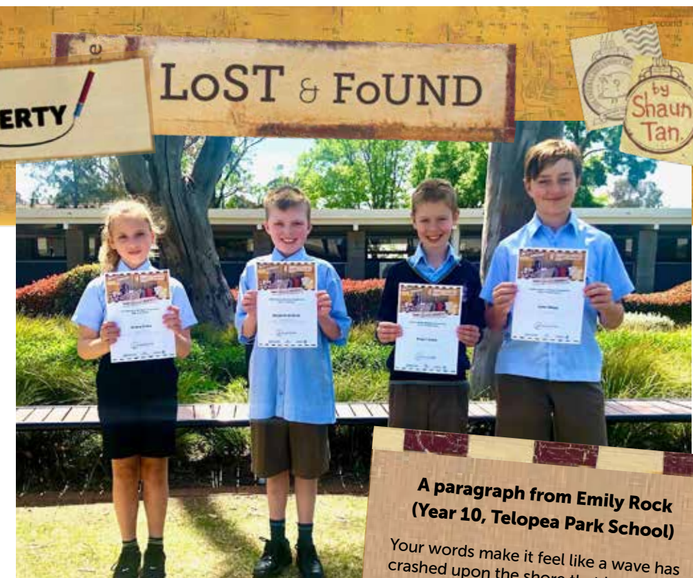
Student winners from Canberra Grammar School

Jackie French OAM, award-winning Australian writer and Pens Against Poverty competition judge says "this competition can be seen as a starting point for young people to begin to study, understand and empathise with the many different forms of poverty and the