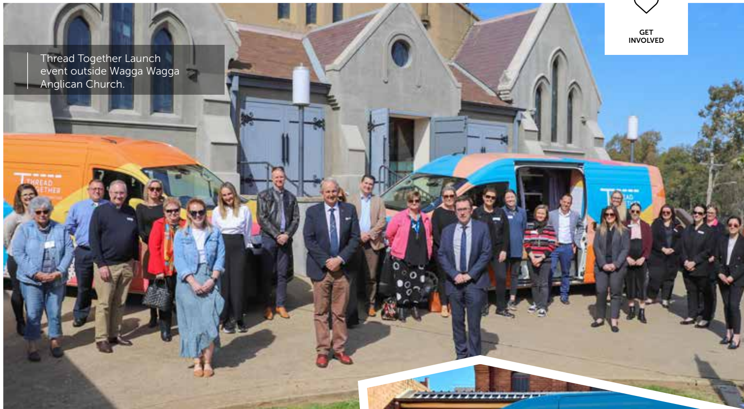
Thread Together Launch event outside Wagga Wagga Anglican Church.